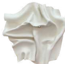
KOKI GHOSTING (TALINIS) 2023 Unglazed Porcelain 20.32 x 20.32 cm | 8 x 8 in