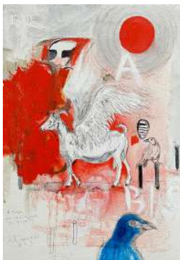
KITTY TANIGUCHI UNTITLED (A STUDY FOR THE SERIES, THE VICINITY) 2023 Acrylic & Ink on Canvas 61 x 43 cm | 24 x 16.92 in 2 x 1.41 ft