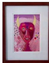
MARIANNA VARELA SIGBIN (MONSTER) 2023 Digital Painting 48.26 x 39.37 cm | 19 x 15.5 in (framed) 28 x 19.5 cm | 11.02 x 7.67 in (unframed)