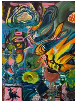
The Well's Ladder Method 16 2023 Acrylic on Canvas 61 x 46 cm | 24 x 18 in 2 x 1.5 ft