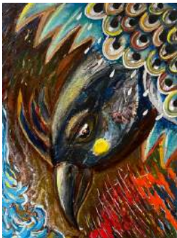
The Well's Ladder Method 1 2023 Acrylic on Canvas 61 x 46 cm | 24 x 18 in 2 x 1.5 ft