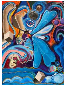
The Well's Ladder Method 10 2023 Acrylic on Canvas 61 x 46 cm | 24 x 18 in 2 x 1.5 ft