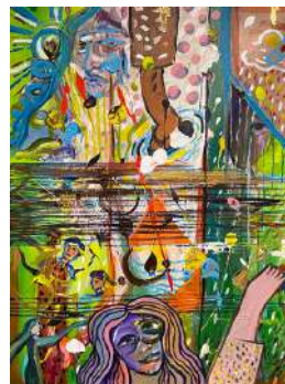
The Well's Ladder Method 12 2023 Acrylic on Canvas 61 x 46 cm | 24 x 18 in 2 x 1.5 ft