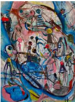
The Well's Ladder Method 15 2023 Acrylic on Canvas 61 x 46 cm | 24 x 18 in 2 x 1.5 ft