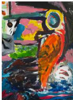
The Well's Ladder Method 20 2023 Acrylic on Canvas 61 x 46 cm | 24 x 18 in 2 x 1.5 ft