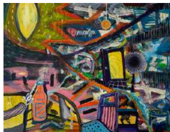
The Well's Ladder Method 8 2023 Acrylic on Canvas 46 x 61 cm | 18 x 24 in 1.5 x 2 ft