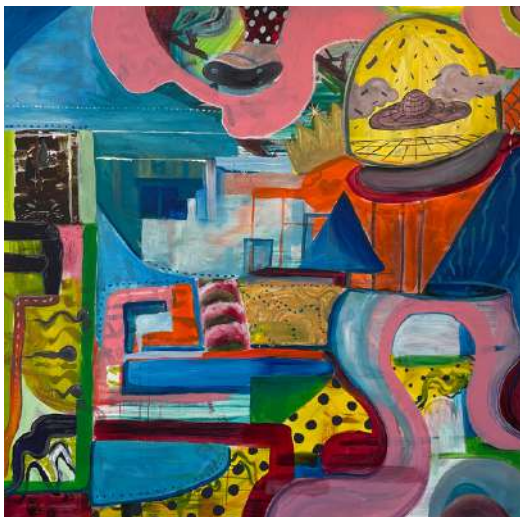
The Well's Ladder Method 17 2023 Acrylic on Canvas 121.92 x 121.92 cm | 48 x 48 in 4 x 4 ft