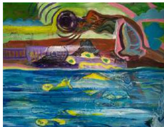
The Well's Ladder Method 14 2023 Acrylic on Canvas 46 x 61 cm | 18 x 24 in 1.5 x 2 ft