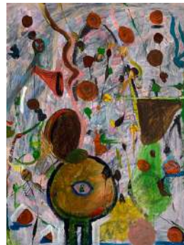
The Well's Ladder Method 6 2023 Acrylic on Canvas 61 x 46 cm | 24 x 18 in 2 x 1.5 ft