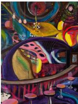
The Well's Ladder Method 7 2023 Acrylic on Canvas 61 x 46 cm | 24 x 18 in 2 x 1.5 ft