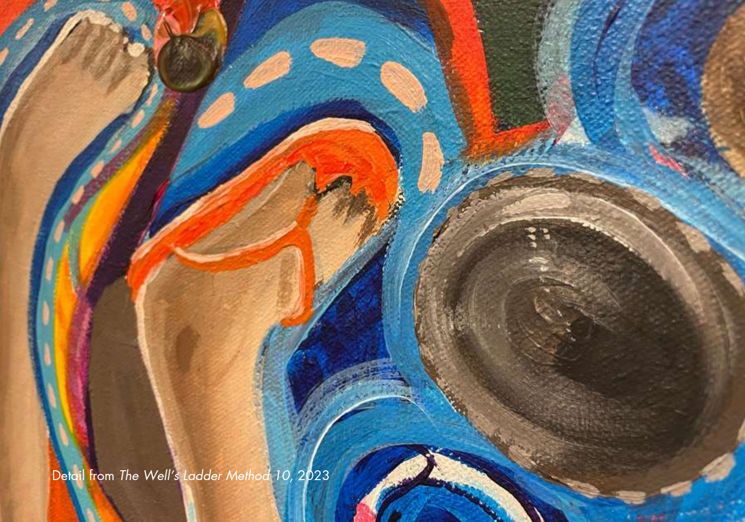
Detail from The Well's Ladder Method 10 , 2023