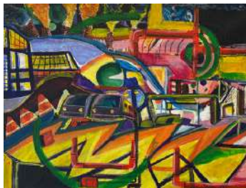
The Well's Ladder Method 11 2023 Acrylic on Canvas 46 x 61 cm | 18 x 24 in 1.5 x 2 ft