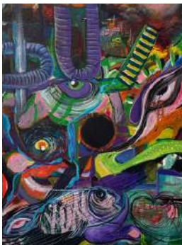
The Well's Ladder Method 3 2023 Acrylic on Canvas 61 x 46 cm | 24 x 18 in 2 x 1.5 ft