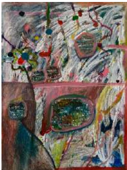
The Well's Ladder Method 5 2023 Acrylic on Canvas 61 x 46 cm | 24 x 18 in 2 x 1.5 ft