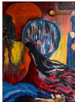
The Well's Ladder Method 4 2023 Acrylic on Canvas 61 x 46 cm | 24 x 18 in 2 x 1.5 ft