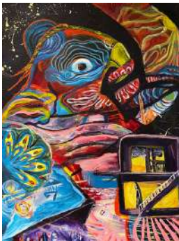
The Well's Ladder Method 9 2023 Acrylic on Canvas 61 x 46 cm | 24 x 18 in 2 x 1.5 ft