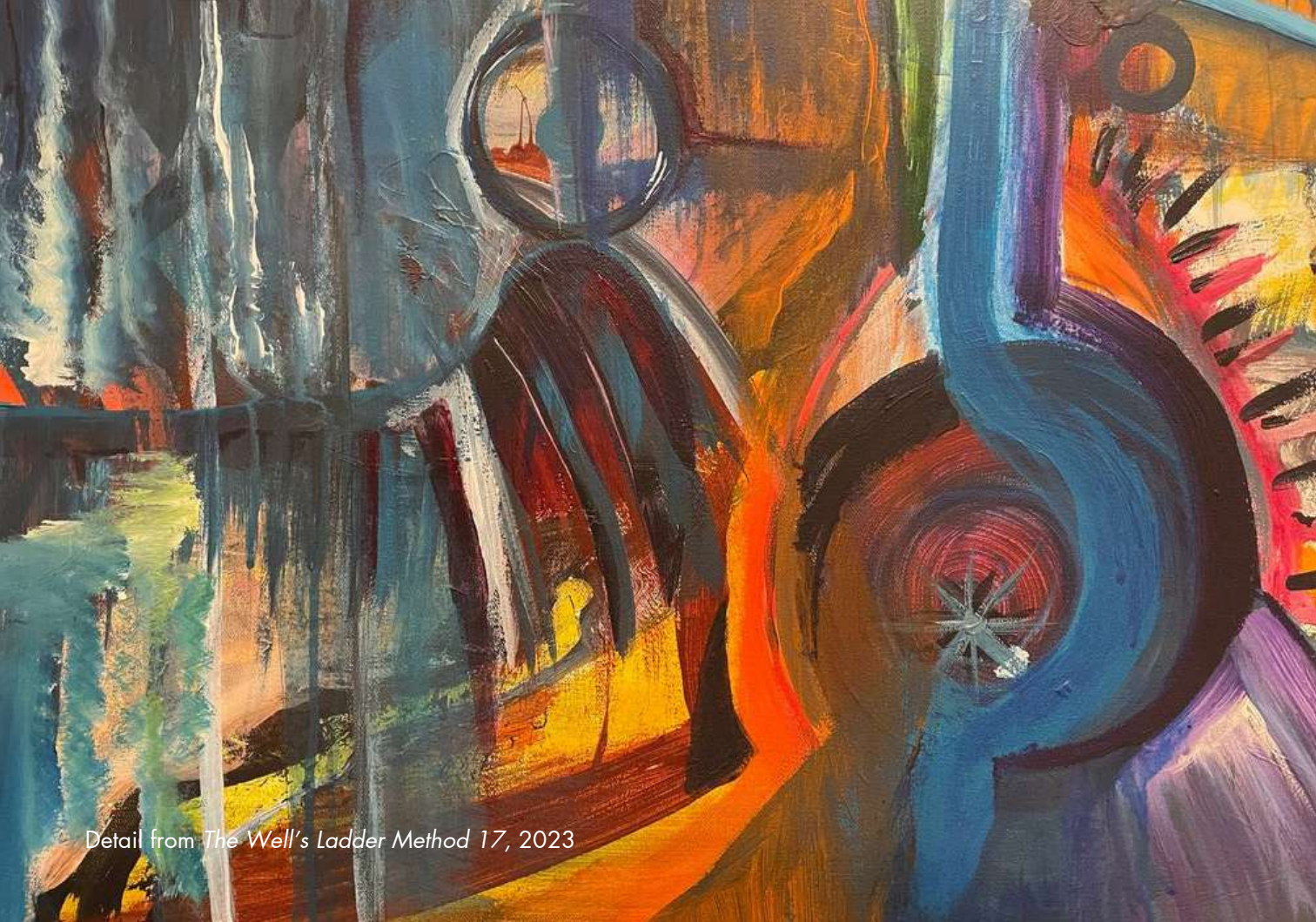
Detail from The Well's Ladder Method 17 , 2023