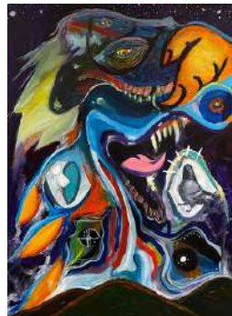
The Well's Ladder Method 2 2023 Acrylic on Canvas 61 x 46 cm | 24 x 18 in 2 x 1.5 ft