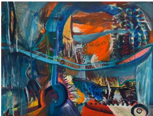
The Well's Ladder Method 17 2023 Acrylic on Canvas 91.44 x 121.92 cm | 36 x 48 in 3 x 4 ft