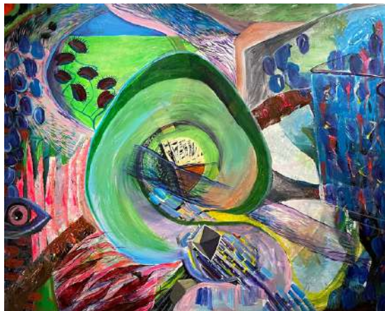
The Well's Ladder Method 18 2023 Acrylic on Canvas 121.92 x 152.4 cm | 48 x 60 in 4 x 5 ft