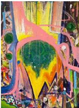
The Well's Ladder Method 13 2023 Acrylic on Canvas 61 x 46 cm | 24 x 18 in 2 x 1.5 ft