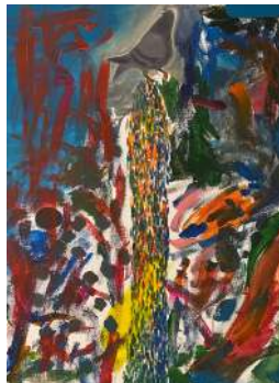
The Well's Ladder Method 20 2023 Acrylic on Canvas 61 x 46 cm | 24 x 18 in 2 x 1.5 ft